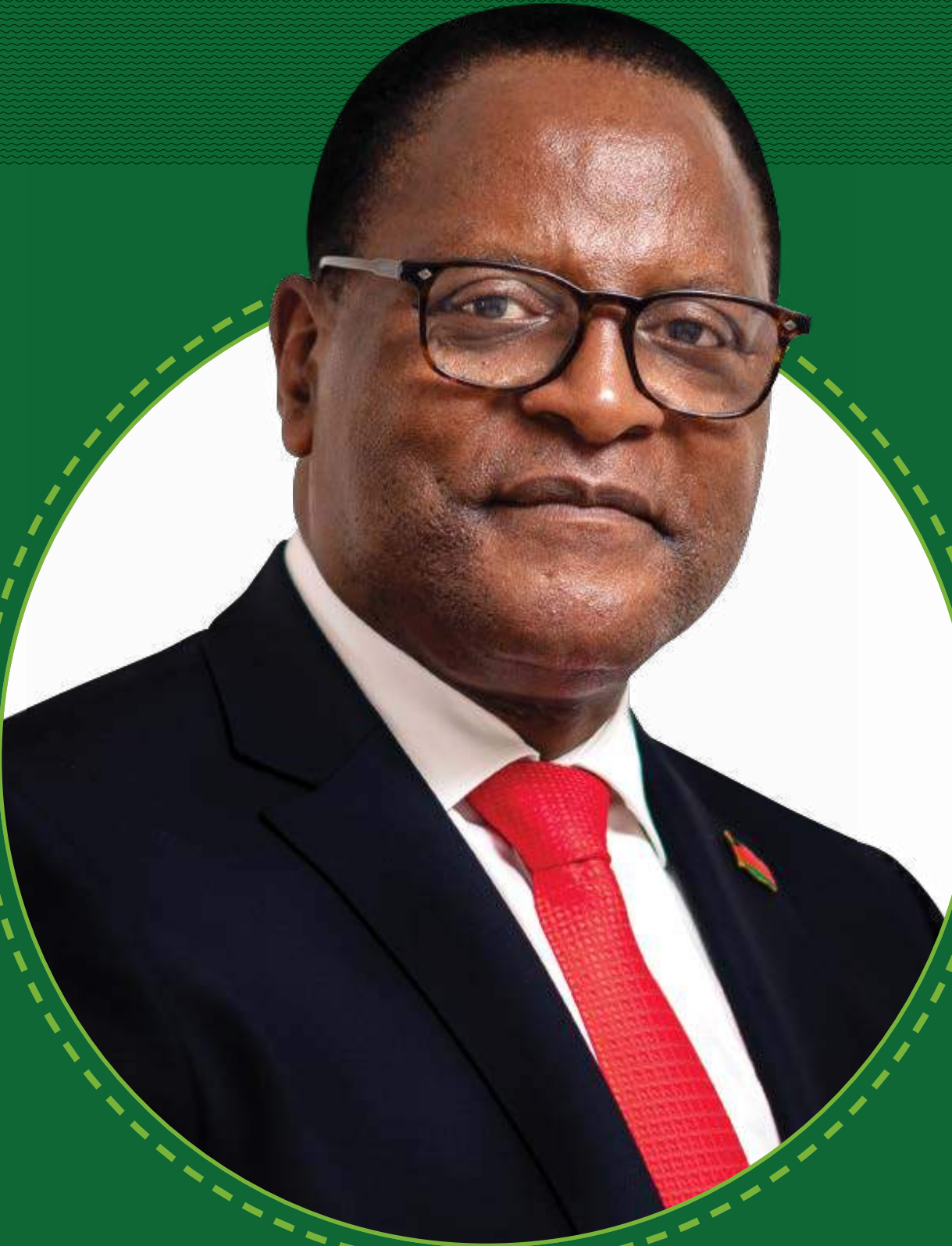
DR. LAZARUS MACCARTHY CHAKWERA PRESIDENT OF THE REPUBLIC OF MALAWI