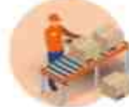
REPRESENTATIVES OF ALL AFFECTED EOs