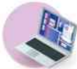
FREIGHT FORWARDING AND LOGISTICS COMPANIES