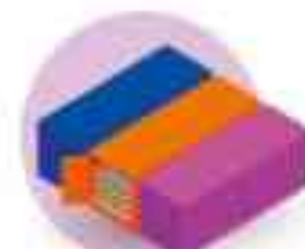
SEA, RAIL AND ROAD TRANSPORT