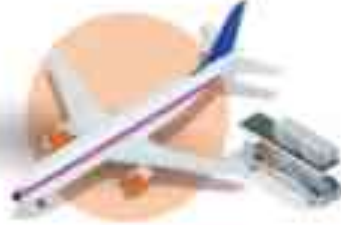
AIR CARGO CARRIERS