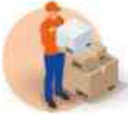
POSTAL OPERATORS INSIDE AND OUTSIDE THE EU