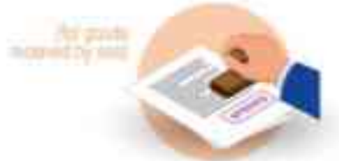
FINAL CONSIGNEE ESTABLISHED IN THE EU