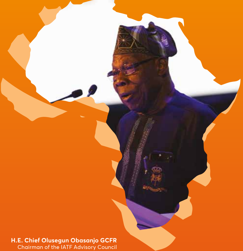
H.E. Chief Olusegun Obasanjo GCFR Chairman of the IATF Advisory Council and Former President of Nigeria

IATF2025 will provide a unique and valuable platform for businesses to access a single African market of over 1.4 billion people with a GDP of over US$3.5 trillion created under the African Continental Free Trade Area.